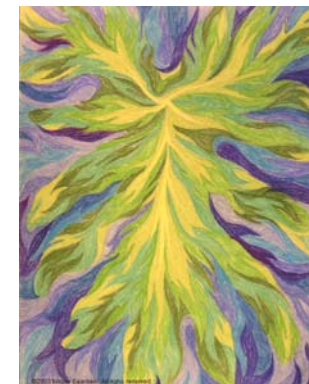
Tree of Life Pastels on paper 14x11" ~ 2004