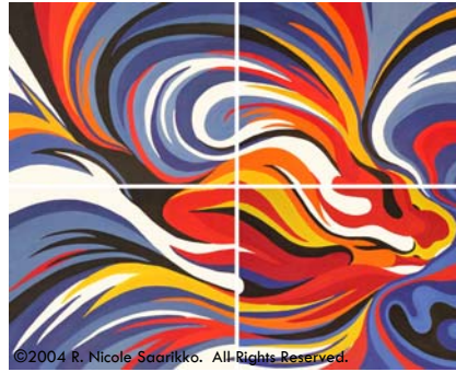
Showa Sanke Oils on canvas 50x62" ~ 2004 (4-24x30" panels)

The impact of various emotions conveyed by the art dramatically changes the "feel" of a room. Interaction with the viewer on a personal level can evoke feelings of serenity, tranquility, excitement, passion, anticipation, or simply new awareness.