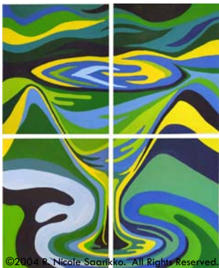
Shaken, Not Stirred Oils on canvas